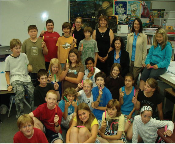
Ombudsman staff visit with grade 6 students at Carman Elementary School in June 2010

Meet Ombudsman office staff and pick up some of our promotional and educational information materials this fall at our display booths at the following locations: